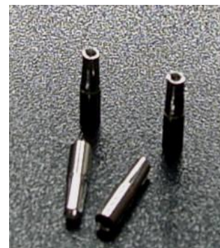
4 point contact construction

Make A More Powerful Connection with Furutech!